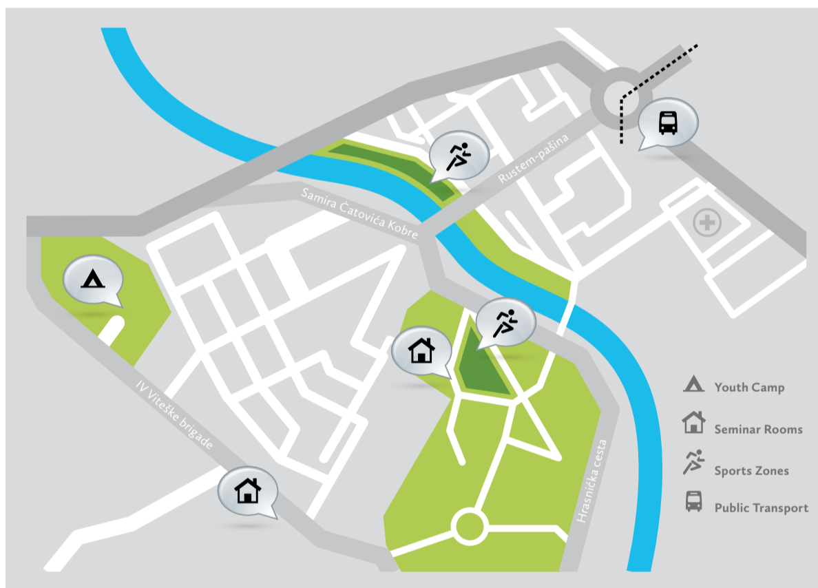
Map of the Youth Camp

More detailed information you can find in the FAQs of the Youth Camp and in the list of activities on the website. For additional information please contact: youth@peaceeventsarajevo2014.eu